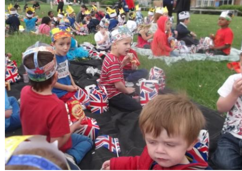
Community Jubilee Day parents, carers and families celebrated together

Senior citizen's coffee mornings – Year 6 gain a sense of our diverse community by serving refreshments and entertain our local residents.