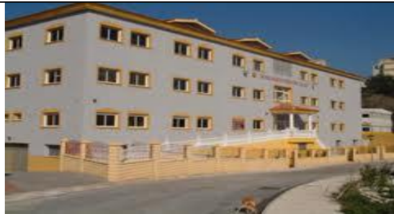
Pen Pals in the Benalmadena International College, Spain help children learn about children's lives in other countries