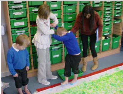
Students from Hamilton College help with a community art project

Red nose Day – Children throughout the school learnt about how they can make a difference to our wider world community. Children raised money to buy mosquito nets and showed they cared.