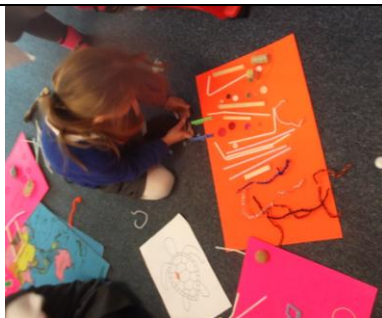
Art Day- We looked at art around the world