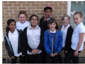
Following an afternoon where members of the community came and talked to Year 6 about their faith. A group of children asked to raise money for a dormitory for children in Poland. They raised £75.