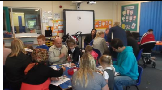
Parent and carers Workshops – parents and children learn lots together.