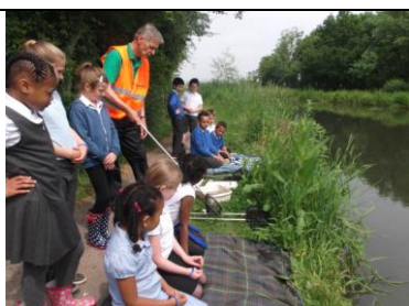
Foxton Locks visit - Children learn about the wider local area where we live.