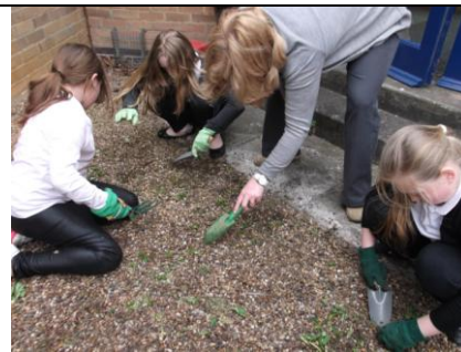
Eco Warriors - Children learn to care for our world