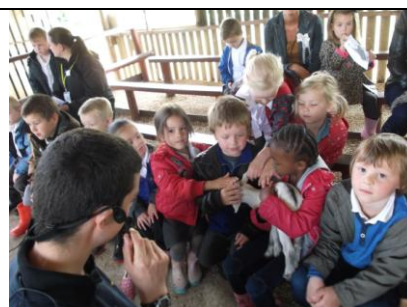
Farm Trip - Children go out into the community on trips