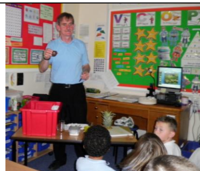
Geography Day – Children learnt about different things around the world