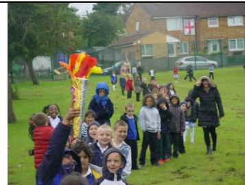
The winning olympic torch was passed around our whole school by every member of our school community.