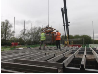
Big writing day linked to new building work at school