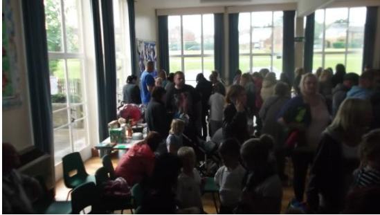
School Fete – everyone gets involved

Scraptoft Valley Primary School is a vibrant and diverse school made up of many communities. We have staff, parents and pupils who have links all over the world and have very different life experiences. We are immensely proud of the relationships we have with the communities we have links to whether local, national and global levels.