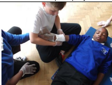
Basic First Aid Certificates – Children learn to care and become good citizens