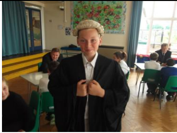
World of Work Day – Children are encouraged to have goals to aim for and achieve