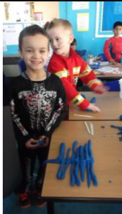
World Book Day . Our children joined with children all around the world to enjoy books.